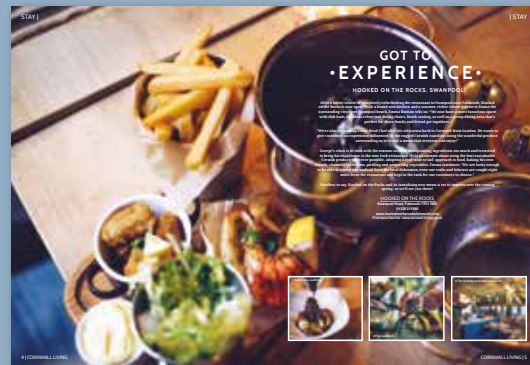
DOUBLE PAGE EDITORIAL