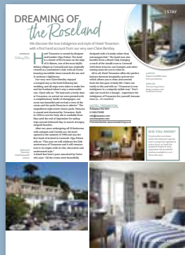
FULL PAGE EDITORIAL