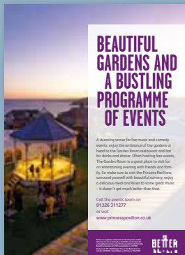
FULL PAGE ADVERT

ALL PRICES ARE EXCLUSIVE OF VAT AT STANDARD RATE.