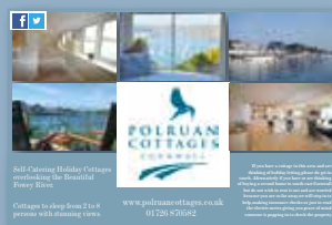
HALF PAGE ADVERT