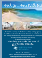
QUARTER PAGE ADVERT